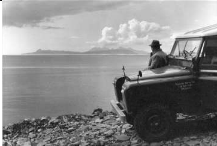
Colin Watt, Engineer for the south section of the road.