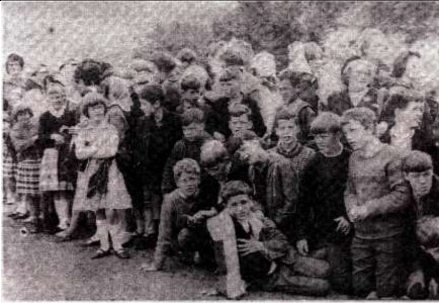
Road opening at Lochailort, 29th July 1966