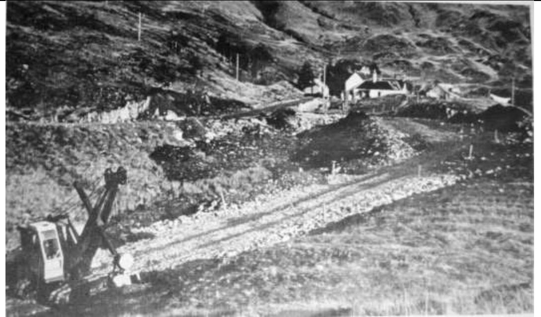
The new road approaching the single track road at Lochailort Inn